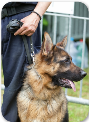
Law Dog Kastle's